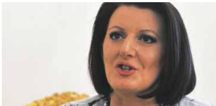
Message from the President of the Republic of Kosovo Atifete Jahjaga