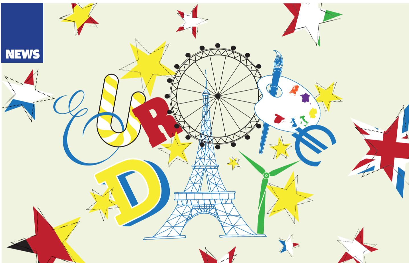
EU DAY organized jointly by EU and Kosovo's Ministry of European Integrations. DESIGN BY INIT