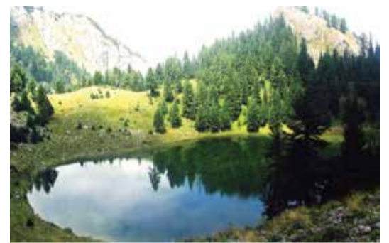
PHOTOGRAPHS KOSOVGUIDE, FLYINGFORKOSOVO