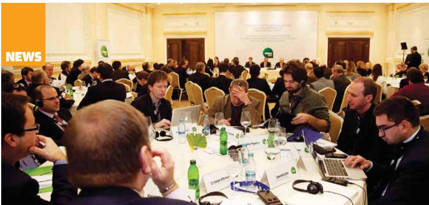
Image from last year's inaugural edition of Germia Hill.